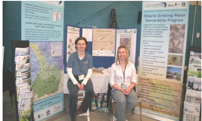
Education & Outreach Specialists at the Chesley Agrifair 2010.