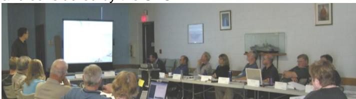
April SPC meeting, Owen Sound Royal Canadian Legion

Comments on the Draft Proposed Assessment Report must be received in writing by June 10, 2010 at 4:30pm. Comments received from the public will then be reviewed and considered by the SPC.