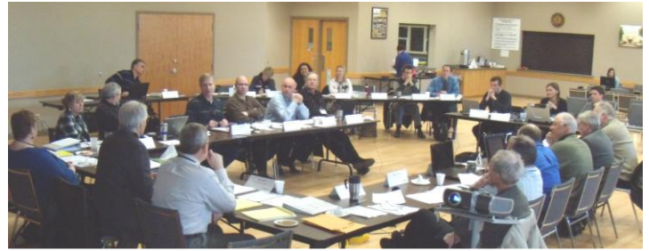
March SPC meeting, Neustadt Community Centre Hall

The second commenting period will take place in July 2010, in which the Proposed Assessment Report will be available to the public. This period will allow for public comments to be submitted to the Source Protection Authorities.