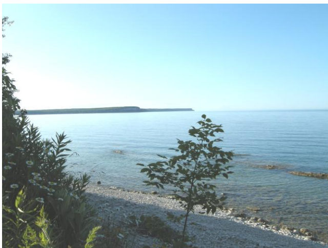
Lion's Head Intake Protection Zone

On Saturday, June 12, 2010, stop by the DWSP booth at the Walkerton Community Centre Auditorium to visit us and other water-related industry displays.